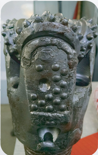
BIT AFTER DRILLING 50 PLUGS

On the reverse side you will find information highlighting some of the run data that we have seen with our new BULLSEYE™ Bit Saver . Please contact your local PTECH Canada sales rep to find out how our new product can enhance your drilling program, saving you time and money.